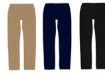
BEIGE, BLUE OR BLACK CHINOS (NO JEANS)