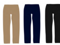
BEIGE, BLUE OR BLACK CHINOS (NO JEANS)