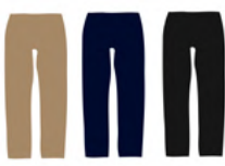
BEIGE, BLUE OR BLACK CHINOS (NO JEANS)